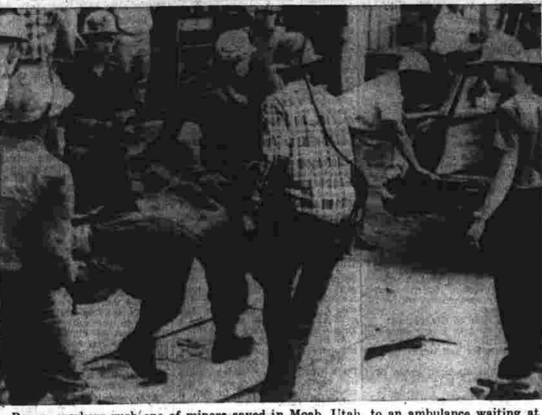
Rescue workers rush one of miners saved in Moab, Utah, to an ambulance waiting at the entrance of the potash mine in which an explosion killed 18.